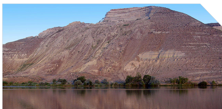
Fossil Beds National Monument in Hagerman, ID

There are many great ways to explore Craters of the Moon: Drive the loop that winds through the monument, hike to caves and impressive craters, or ski and snowshoe in the winter.