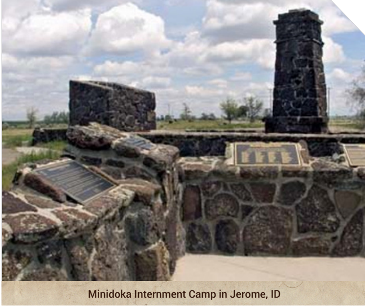
Minidoka Internment Camp in Jerome, ID