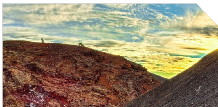
Craters of the Moon National Monument in Arco, ID

Southern Idaho is home to four of the most interesting and diverse national monuments in the nation, all rich in history – both natural and human. Each one is packed with educational and recreational opportunities, from learning about ancient eras to exploring one of the darkest chapters of our recent past.